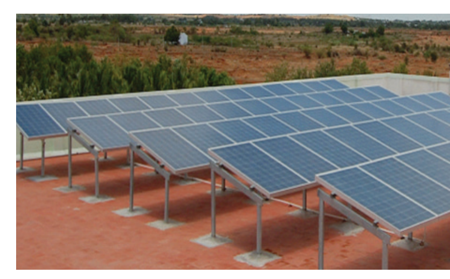
Penguin Apparels Pvt Ltd and Peacock Apparel Pvt Ltd, installed solar panels that provide over one third of their energy

Fair Trade USA recognizes the importance of a healthy environment for all, as well as the great challenges that lie ahead - not only from climate change, but other critical issues including biodiversity loss, plastic pollution, and food waste. The organization is committed to continuous improvement in its approach to ensuring that fair trade products are produced in an environmentally responsible manner and that producers have the support they need to do so. Equally as important, Fair Trade USA and their partners continue to seek ways to build resilience within the communities and production systems of the farmers, fishers, and workers. As the heart of fair trade, this approach enables them to sustain their production, and their livelihoods, over the long term in a changing world.